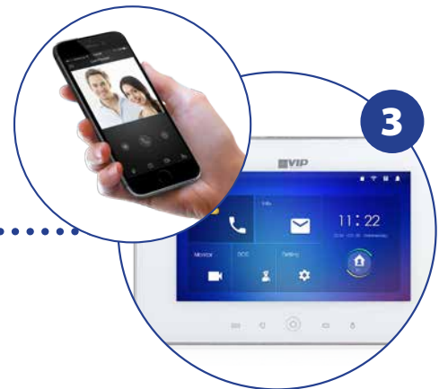
3 Live view, snap images, answer visitors and even unlock doors from anywhere