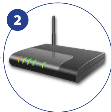
2 Connect your WiFi intercom to your network and the Internet