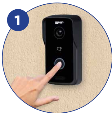
1 Install your WiFi intercom system simply by connecting to power

Enjoy two-way video/audio talk, visitor video messaging, record door station camera snapshots/footage and more. The door station can even be used without the monitor by connecting via WiFi to your phone or tablet. Ideal for homes, apartments, duplexes and business, the VIP Vision WiFi Intercom series also integrates with most door strikes and sensors.